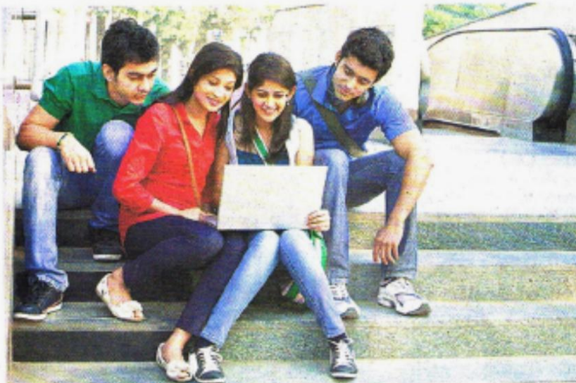
SAVING TIME: Students can now access MBA course materials on their mobile phones or laptops.

At present, at least 2,500 students have enrolled to study MBA course through the internet with Pondicherry University's distance education programme. Online delivery of distance education courses is enabled by the Avagmah Technology Platform, which can be ac-